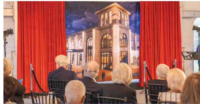
UNVEILING THE DESIGNS FOR THE COMMUNITY CENTER FOR THE ARTS

The College unveiled the designs for the Community Center for the Arts, a joint project between the College and Glynn County Board of Education. A special reception was hosted at the College where a group of invitees, who expressed a passion for the performing arts and arts education, gathered to celebrate a crucial step in a decades-long dream. Interior and exterior drawings for the Center were on display to view. The Center will feature an auditorium for 1,000 guests, professional-level acoustics, and space to accommodate musical concerts, dance performances, lectures, meetings, and other community events.