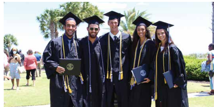
NAVIGATING STUDENTS TOWARD SUCCESS

The Navigator Society, composed of donors giving $1,000 or more to unrestricted funds, has grown with 83 founding members. Giving levels include admiral ($10,000), captain ($5,000-$9,999), commander ($2,500-$4,999), and lieutenant ($1,000-$2,499). These donors support the College's commitment to an "every student, every time" approach.