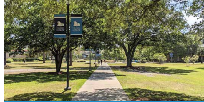
PLAYING A MAJOR ROLE IN SOUTHEAST GEORGIA

The College of Coastal Georgia significantly impacts Southeast Georgia both socially and economically. In fiscal year 2023, the College contributed over $102 million through operating expenses and student and employee spending. The Lucas Center for Entrepreneurship has supported over 450 local entrepreneurs, fostering a 10% growth in new businesses. Strong community partnerships and the dedication of faculty and staff have deepened the College's connection to the region.