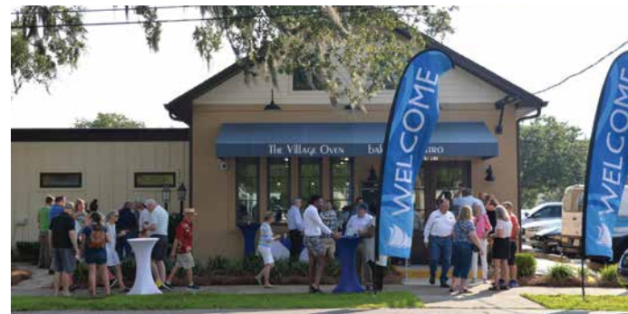
ENJOYING FIRST FRIDAY AT 1407 UNION STREET

The College of Coastal Georgia Foundation acquired 1407 Union Street, formerly The Village Oven, for a new teaching kitchen/lab to enhance the culinary arts program. Located in Downtown Brunswick, the facility will boost the region's hospitality and culinary industries, offering students increased internship and cooperative education opportunities at local restaurants and hotels. This will help students build industry connections and gain practical experience.